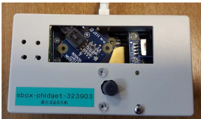
Figure 3 SensorBox

The sensor equipment was developed by our research group [16], which measures various indoor environmental data by using environment sensors included temperature, humidity, lighting intensity, atmosphere pressure, sound volume, human motion and vibration. In additional, we developed an indoor environment sensing service using autonomous SensorBox that can be easily deployed without cost-intensive infrastructure and configuration labour. Figure 3 shows its physical form. Logger in SensorBox, in every time of measurement, create data and modify to JSON formal text, then upload to the Mongo Database.