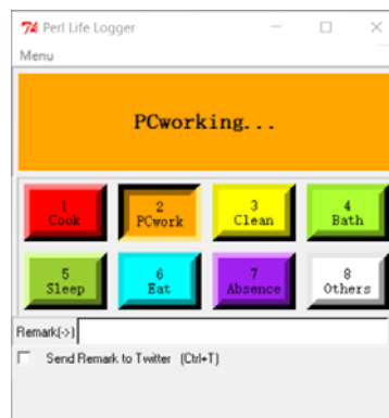
Figure 4 Lifelog tools UI

For supervised learning, the system needs to train data that have the correspondence between the ADLs and sensors data in advance. To label the sensor data, we developed a API, which we will